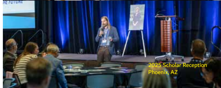
2025 Scholar Reception Phoenix, AZ