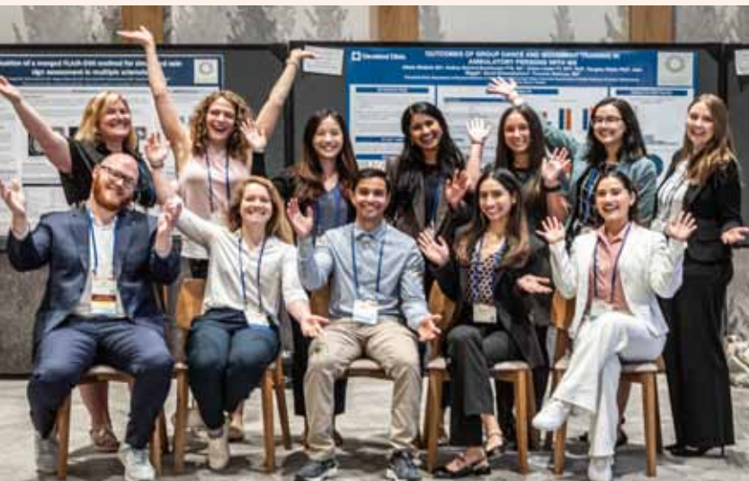
2024 SCHOLAR RECEPTION AND LUNCHEON - NASHVILLE, TN