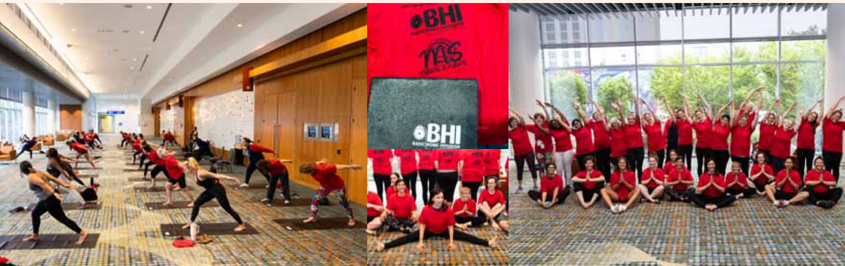
2024 SUNRISE YOGA PROGRAM - NASHVILLE, TN