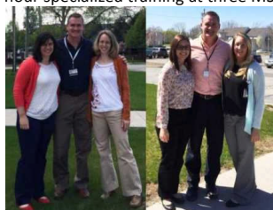
MS Rehab Trainees-Cleveland Clinic

Gives access to education for rehabilitation community at CMSC Annual meeting and through a 35 hour specialized training at three MS CMSC Centers.