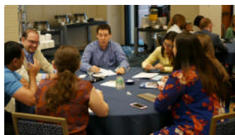
MS Mentorship Scholars

Residents and fellows convene with expert faculty and peer mentors who have begun promising careers in MS.