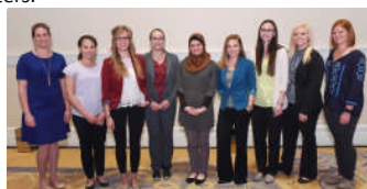
Rehab Annual Meeting Scholars