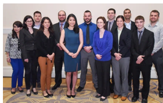
Neurology Residents AM Scholars

Provides specialized MS education to supplement current Neurology training programs.